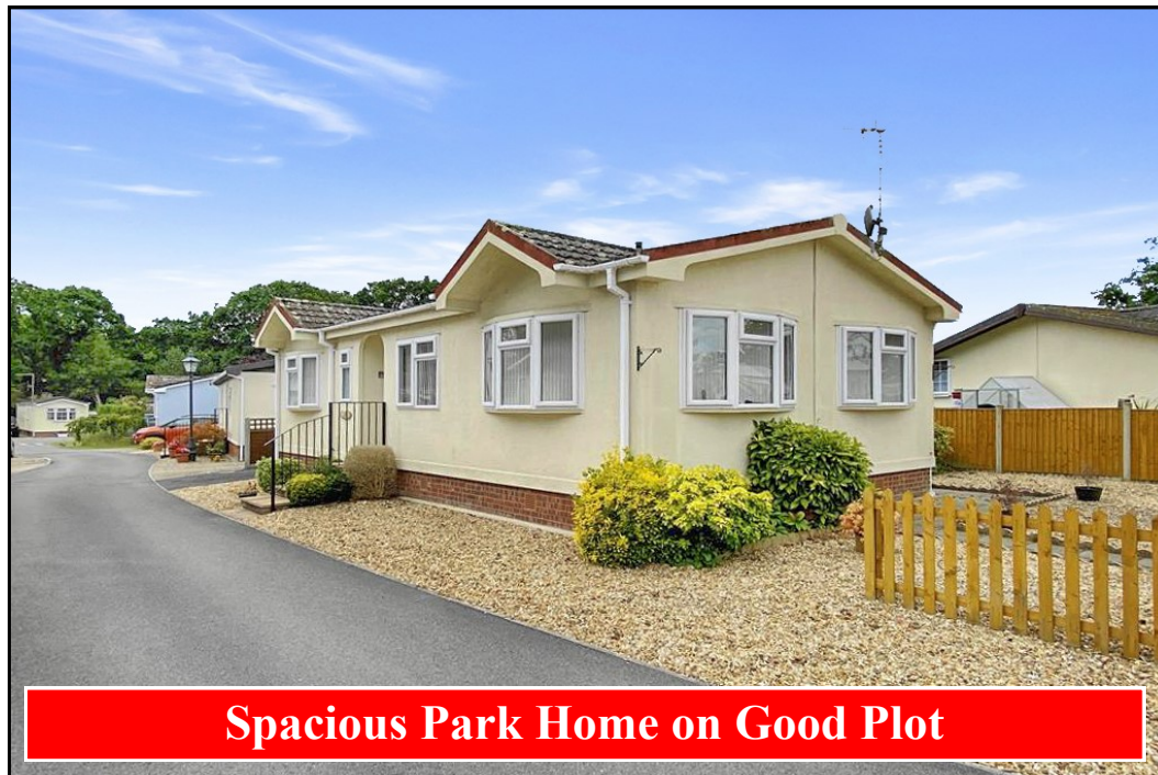
Spacious Park Home on Good Plot

33 The Paddock, Oaktree Park, St Leonards, Nr Ringwood. BH24 2RW